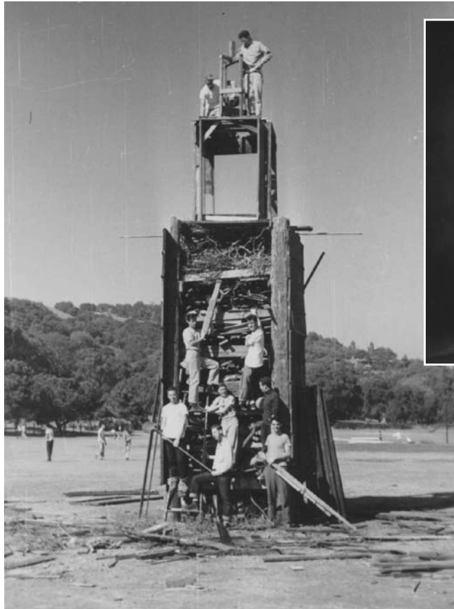
Building Bonfire--sometime between 1944-1950

Now, there is a subject that you don't think about every day, not even every decade. Yes, we did have bonfires at St. Joe's on Halloween Night. This was an event that the Poets and Rhets put on for the rest of us. The Poets and Rhets were allowed to go off campus on Thursdays without being accompanied by a priest. Starting in early October, they would start scouring the area for junk lumber for the big bonfire. St. Joe's had an old pickup truck that they could use to haul the lumber. The bonfire took place in the field between St. Joe's and Maryknoll—further back toward the rear boundary of the seminary. (Note: In earlier years, the bonfire was held on the lower high school campus)